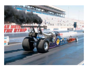
May 15<sup>th</sup>, 2012